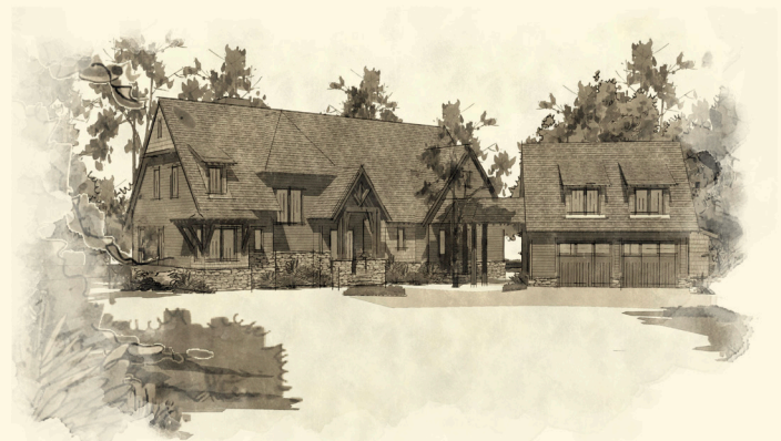
Street Side Elevation

PRICE: With the varied size of the homes and lot selection, pricing will depend on final features and lot selection.