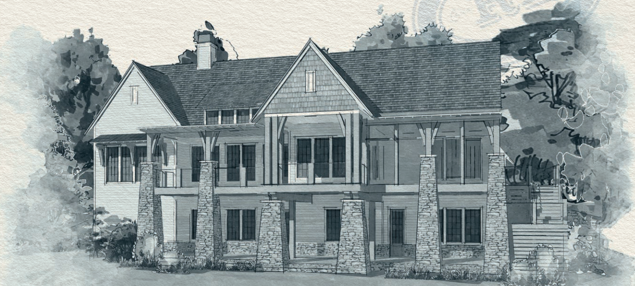
Lake Side Elevation