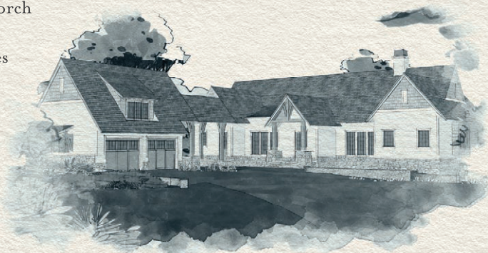
Street Side Elevation

Price: Pricing will depend on final features and lot selection.