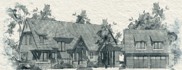
Street Side Elevation

Price: Pricing will depend on final features and lot selection.