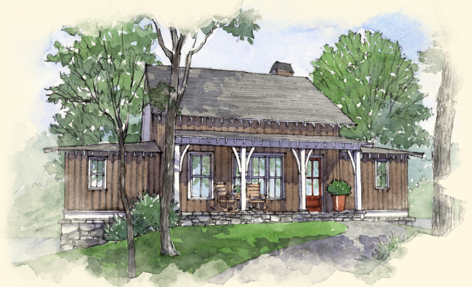
Street Side Elevation

PRICE: Pricing will depend on final features and lot selection.