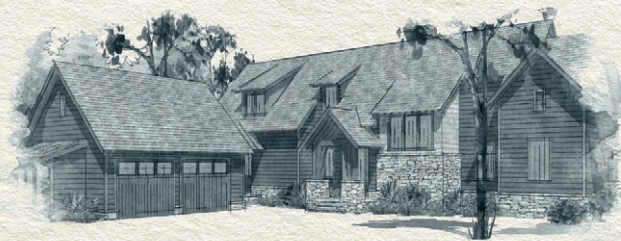
Street Side Elevation

Price: Pricing will depend on final features and lot selection.